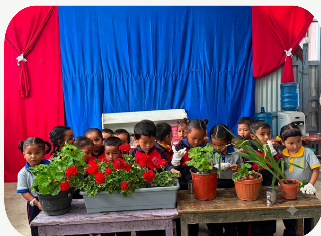
Environment Day Celebration