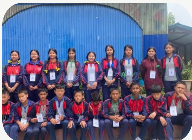
Student Council Election Candidates