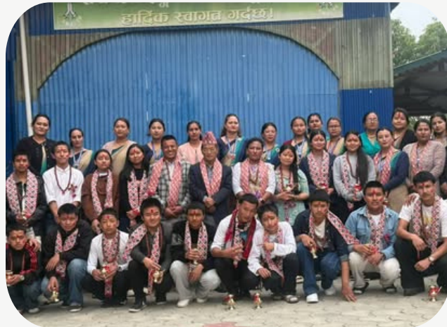
SEE graduates felicitation ceremony