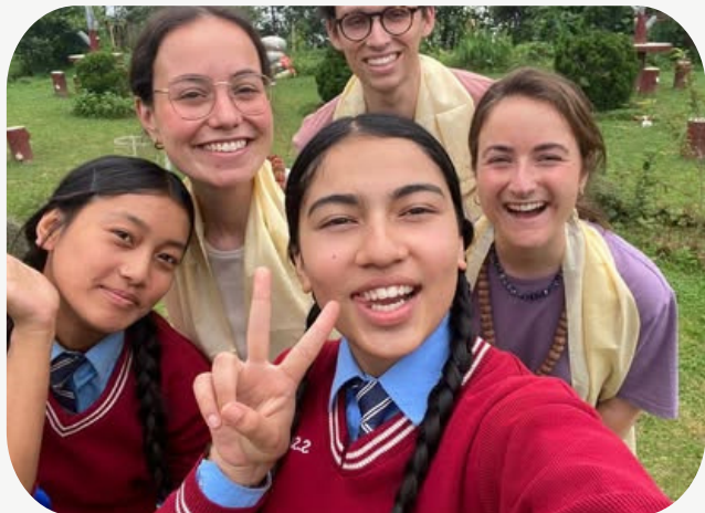
Students with the facilitators after the dental health camp