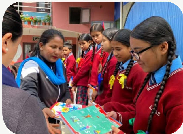
Rewarding the handwriting toppers